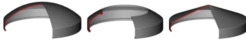
Baby Moon Style